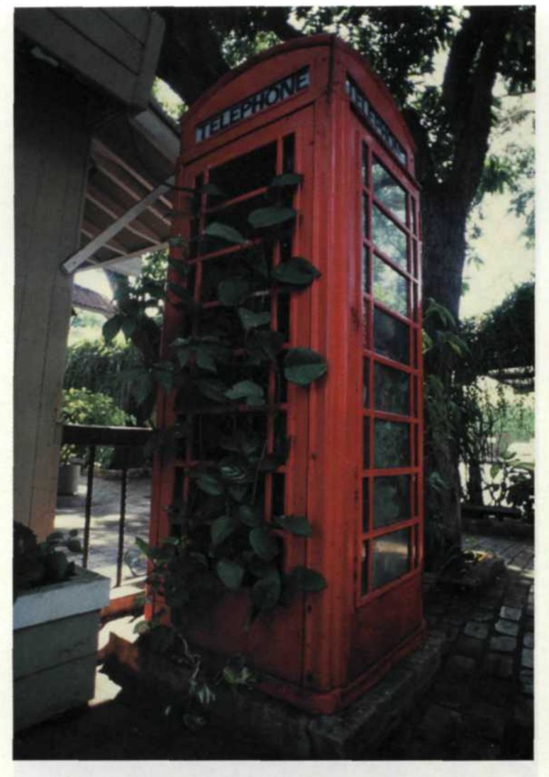
Sensia 200 is Fujifilm's jack-of-all-trades, a great all-around film with the speed to handle many shooting situations, and excellent image quality. Colors are rich and realistic, contrast is snappy, and tonal range is excellent. Sunsets/sunrises, closeups, direct sun, outdoor action, open shade—Sensia 200 can handle it all.

image. Sensia 400 is great for stop-action sports, telephoto lenses and even compact zoom cameras, especially when its fine grain rivals that of ISO 100 slide films.